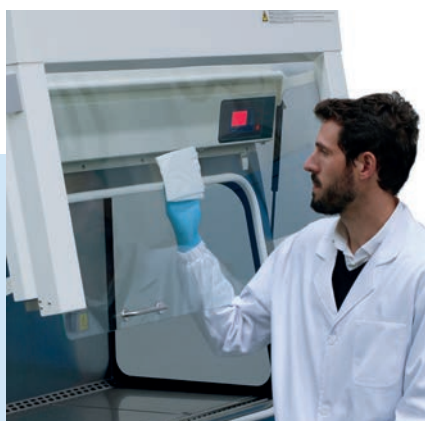
Easy cleaning of the inside window.

The Bio II Advance Plus has a colour screen which enables easy and quick viewing of the safety parameters. The visual display shows the level of filter clogging, which is extremely useful for optimising the service. The display also shows laminar speed flow to control the cabinet's status at all times.