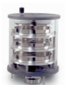
Large capacity chamber