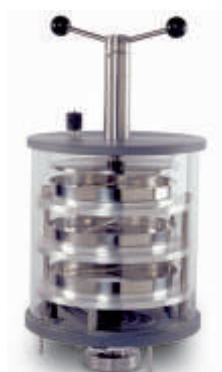
Large capacity stoppering chamber