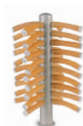
40 port manifold