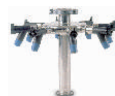
8 port manifold