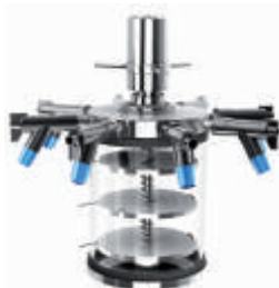
Standard stoppering chamber with 8 port manifold