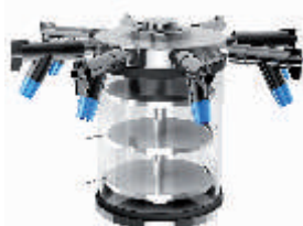
Standard chamber with 8 port manifold